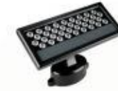
Phantom 40W RGB