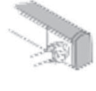
SF- (Right or Left) Side Feed