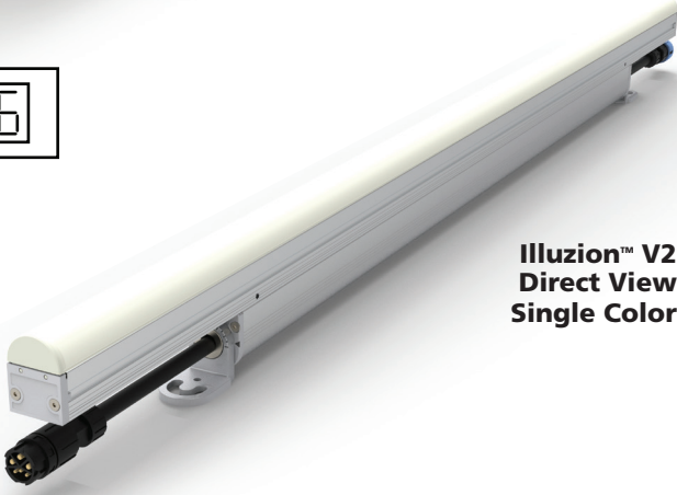
Illuzion™ V2 Direct View Single Color

In DMX/RDM operation with a DMX/RDM signal connected on digital readout, push button A to select digit 1, then push button B to address channel number (100's). When you select the desired number from 0–9, pause until it stops flashing. Push button A again to select digit 2, then push button B to address channel number (10's). When you select the desired number from 0–9, pause until it stops flashing. Push button A again to select digit 3, then push button B to address channel number (1's). When you select the desired number from 0–9, pause until it stops flashing.